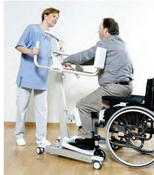
Grasping the raising handles, the patient pulls himself up to a standing position.