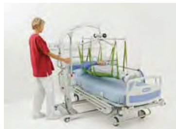
When the Viking is used in combination with the Octostretch, it is ideal for patient transfers in settings such as surgical and radiology departments as well as the ICU.