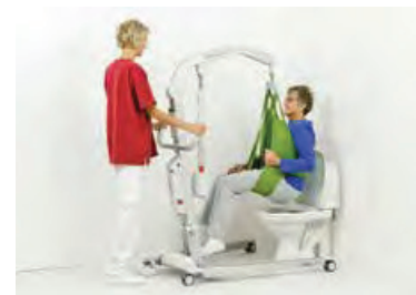
Viking M is very easy to manoeuvre in confined spaces, making it an ideal lift for hygiene-related situations.