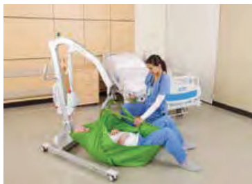
The open undercarriage allows for sufficient space around the patient for lifting to and from the floor.